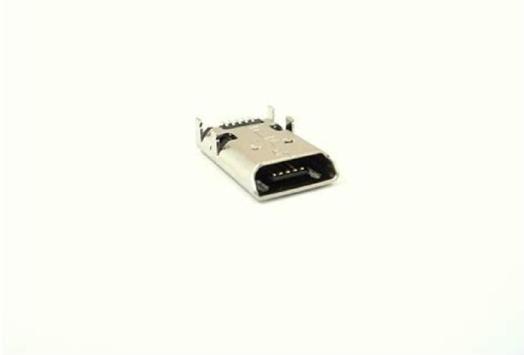
Asus t100ta won't boot from usb. Asus transformer t100taf boot from usb. How to boot asus transformer from usb. Asus transformer book t100ta boot from usb. Asus t100ta boot menu.